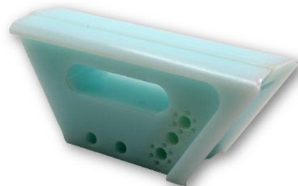
Figure 1 – OEM Ice Cream Automation Machine Plastic Components for Dispensing Aperture

The ice cream processor researched onshoring options for USA-based companies specializing in replacement parts for the food processing industry. They decided on Boedeker Plastics to help identify the material and solve this problem. The first step was to send a sample part to Boedeker Plastics for evaluation and assistance.