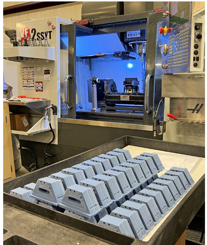
Figure – 3 Team Boedeker Machined LubX® C Replacement Parts

The application involved significant sliding wear and exposure to cold temperatures. Based on these requirements, Team Boedeker recommended LubX® C as an ideal replacement, which offers up to 60% lower friction than standard UHMW against steel. (Figure 2) LubX® C also performs exceptionally well in applications involving sliding wear and low-temperature environments.